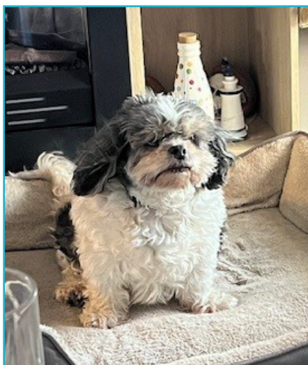
Pictured above is Jasper.

Jasper, meanwhile, has a cheeky habit of stealing Missy's bed, leaving her to squeeze into his much smaller one. Yet Missy never complains—she's just happy to be near her best buddy. Now that's true friendship!