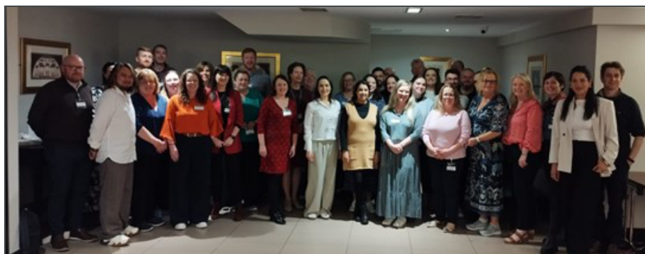
Pictured above, the ICT for Public Health Team comes together for their team day at the Ashling Hotel, Dublin.