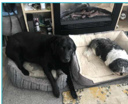
Pictured above are Missy (left) and Jasper (right), cozying up in Missy's bed—a typical scene whenever these two are together!

These two have been best friends for years, and their bond is truly heartwarming.