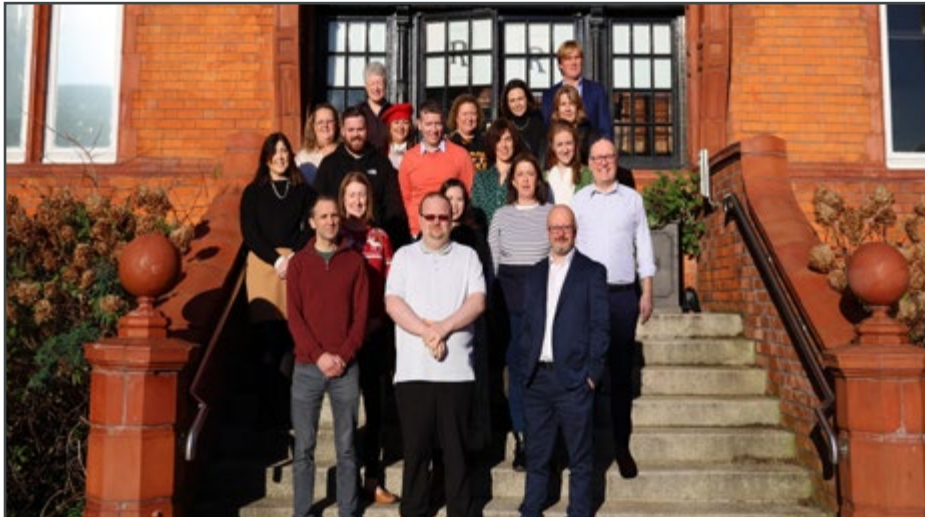
Photographed above are our next group of participants for the eHealth Leadership Programme met up in the Richmond Education & Event Centre back in December.