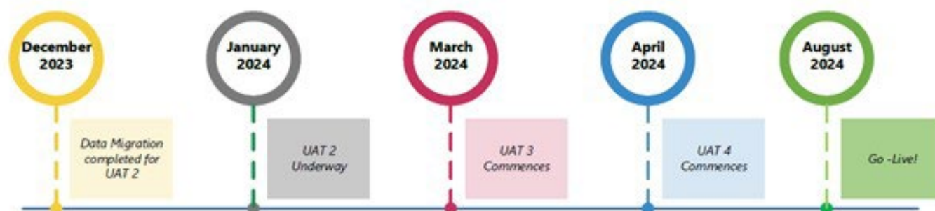
Fig1: Overview of Adult Safeguarding Concerns Case Management System '23/'24 milestones

incredible work gathering data and creating test scripts, which has allowed them to complete Phase 1 of User Acceptance Testing (UAT). The first round of data has been migrated and loaded in to the test environments with the second phase of UAT due to commence