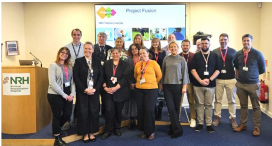
The National Rehabilitation Hospital (NRH) has implemented the National Forensics Mental Health Service Clinical Management System (NFMHS-CMS) which will ensure quality ways of working through digitisation. We hope to have an article from this team for our February edition of the newsletter so check in next month for more info!