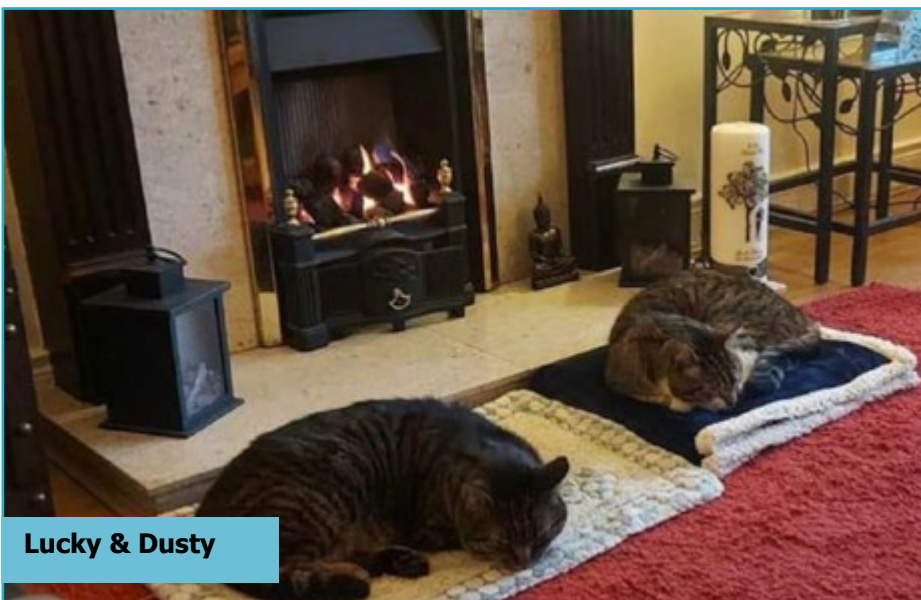
Lucky & Dusty

If you would like us to feature your pet(s) in this section of our Newsletter, get in contact by emailing - communications.ehealth@hse.ie