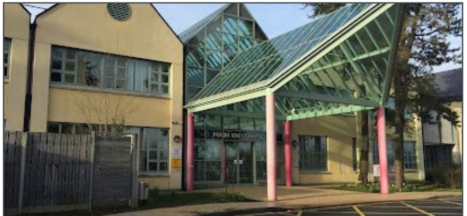
Naas General Hospital

EMIS Health, based in the UK, provides the Symphony software and provides 24x365 support. The software is used in both the Emergency Departments (ED) and in the Acute Medical Assessment Departments (AMAU). It interfaces with IMS Maxims PAS in Naas and in St. Columcille's and IPMS in Connolly hospital, all via HL7 messaging.