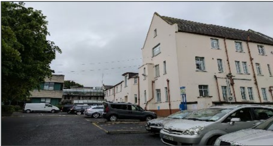
St. Columcille's Hospital

An upgrade to the Midas scanning software that runs alongside Symphony was also completed. This facilitates the scanning of all ED paper records, indexes them and puts them against the patient records on Symphony.