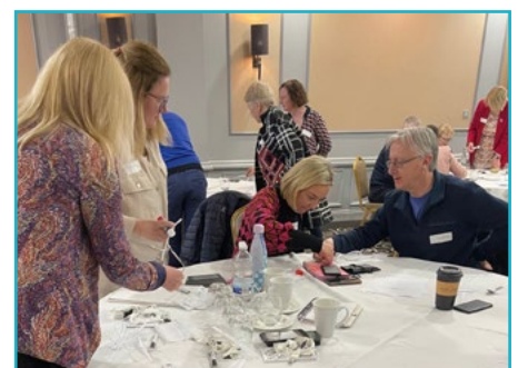
Another team, brainstorming their paper chain ideas.