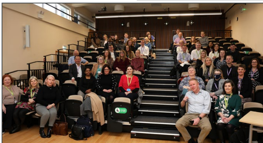
The commencement of Phase 2 with a Roadshow at The Coombe Hospital - above are some of the group that attended.