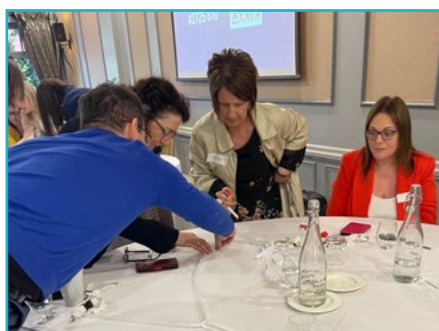
Above one of the teams getting to grips with making the longest paper chain.